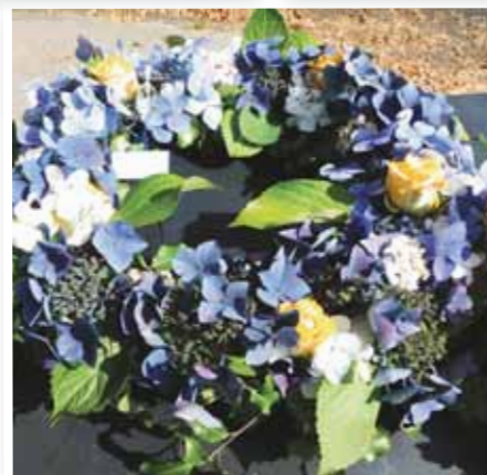
Floral tributes from varied associations and clubs

The townships of Trentham and Malmsbury showing great support, young families and folk were spectators for the wonderful tribute that their town portrayed.