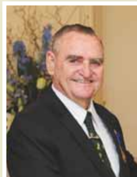
WOII Keith Payne