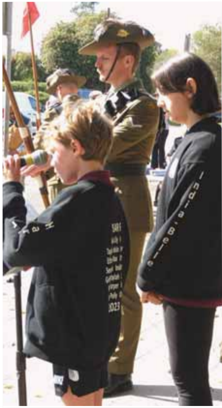
Students from Trentham Primary