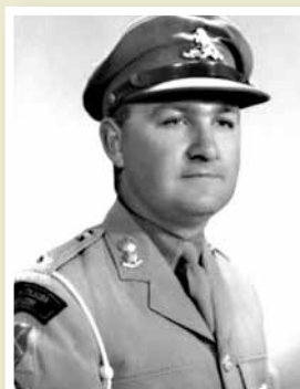
Major Peter Badcoe

In May 1969 WOII Keith Payne was commanding the 212th Company of the 1st Mobile Strike Force Battalion when it was attacked by a strong People's Army of Vietnam force. Despite being seriously wounded he returned to the battlefield and spent three hours, frequently under fire, searching for any remaining members of his unit. Payne located about 40 of his men, most of them wounded; he assisted some of the wounded himself and organised assistance for others, before leading the party back to base through an area now dominated by enemy forces. Payne's actions that night earned him the VC.